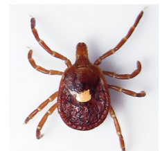
American Dog Tick